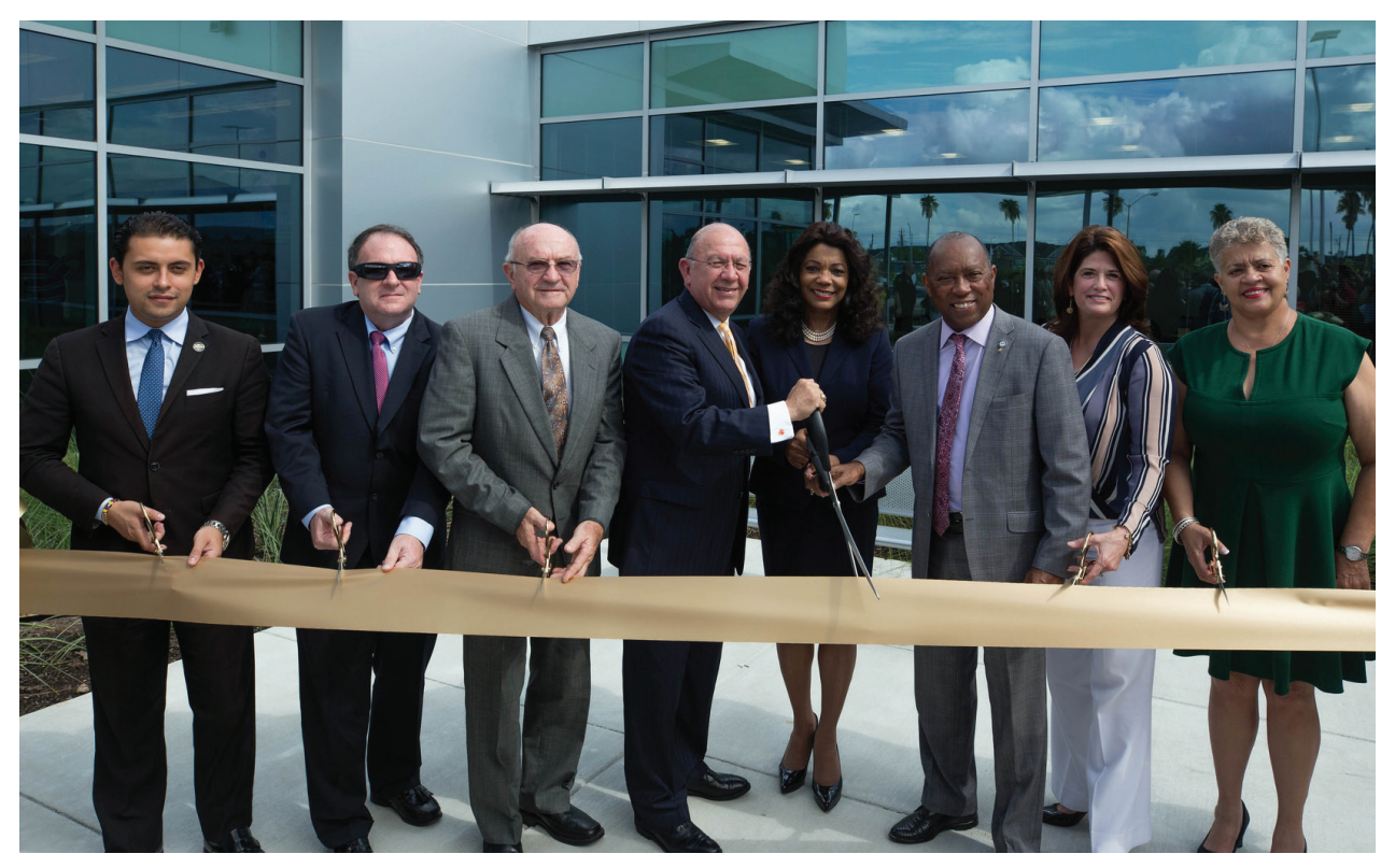
Celebrating new campuses

Short on funds for college? Discover all the ways you can find money for school at hccs.edu/financialaid